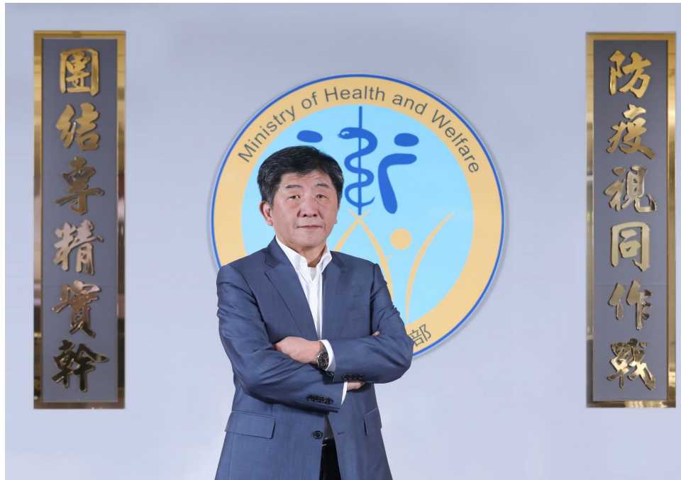
Dr. Chen Shih-chung