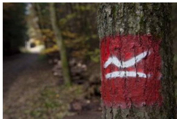
Rothaarsteig zwischen Brilon und Dillenburg